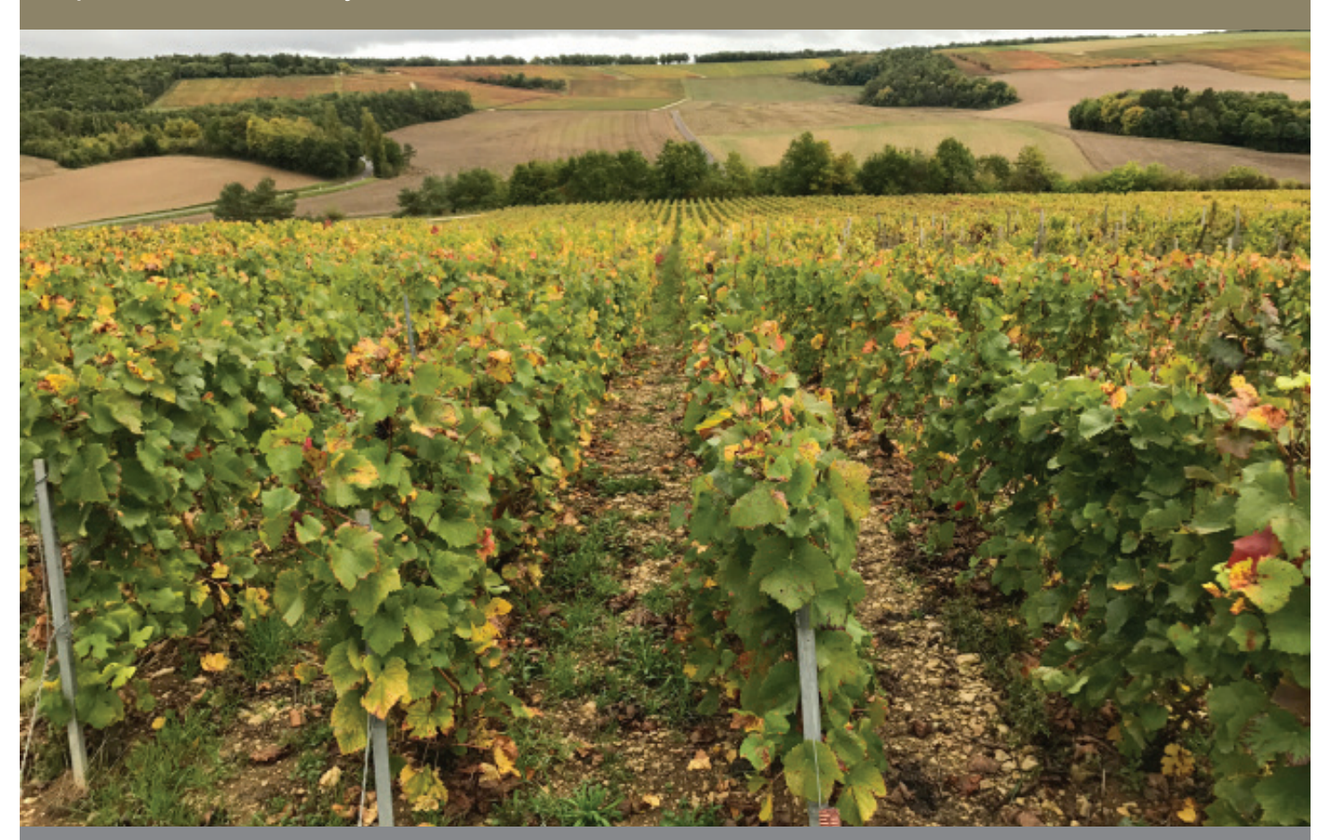
View from the top of the l'Argillier vineyard in Vile-sur-Arce

This when the "Burgundization" of Champagne started to kick in. Where for centuries the concept of "blending everything" had been the accepted norm, the new rebels began to turn the focus on making wines of Terroir - wines that specifically represented the unique parcels of land they came from - the mantra of Burgundy. Pinot Meunier, long relegated to a lower-tier status as "just a blending grape", started coming to the forefront and we saw an explosion of 100% Pinot Meunier Champagnes. Everything conventional wisdom said you "can't do" in Champagne started being done, and done successfully. Suddenly, in the blink of an eye, Champagne had become the most exciting and dynamic wine region in the world - a place that had essentially been asleep for the previous 200-300 years.